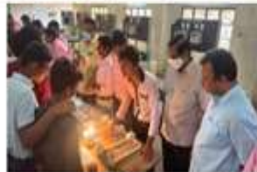
Working Cycle of Air Conditioning System Training Programme provided by BlueStar Ltd., Chennai for Ref. & AC Trainees