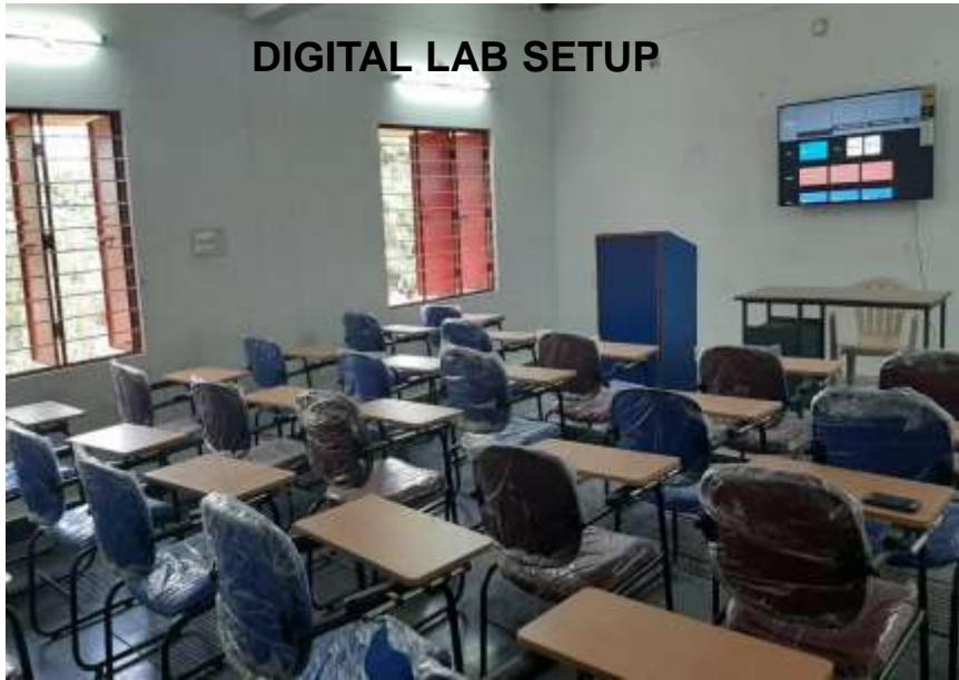
DIGITAL LAB SETUP