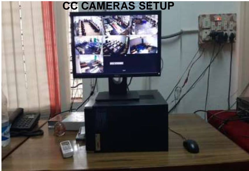
CC CAMERAS SETUP