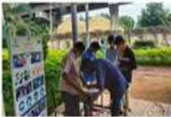
Maintaining Covid-19 Protocol