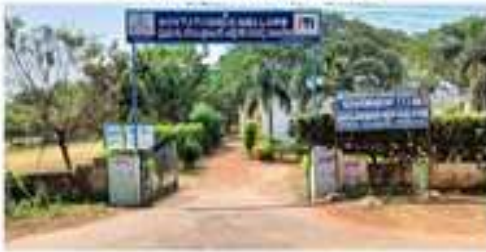
Govt. ITI (Girls), Nellore