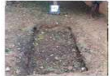
Hazardous Waste Management