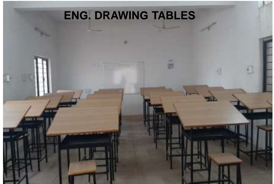
ENG. DRAWING TABLES