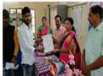
Women's Day Celebrations & Women's Safety Awareness Program